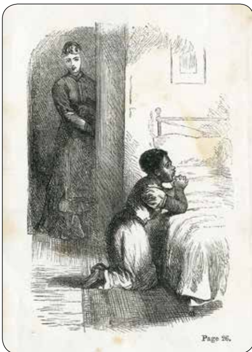
May at prayer (illustration from May, the Little Bush Girl)

May was not the only indigenous child who died after moving to England.